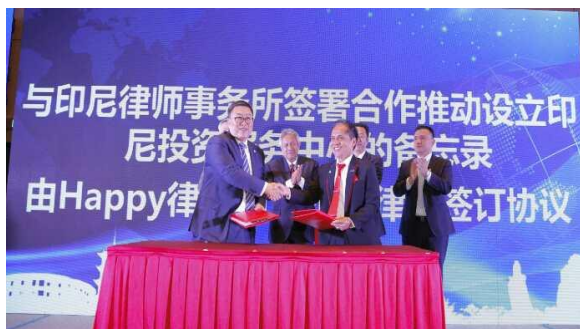
MoU between TOPWE Law Firm, Happy SP Sihombing Law Firm and Mega Global Investment