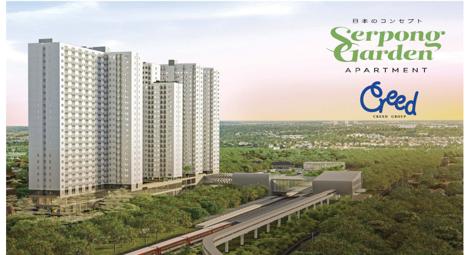
Location Cisauk, Tangerang 26 stories + 1 Semi-Basement Apartment