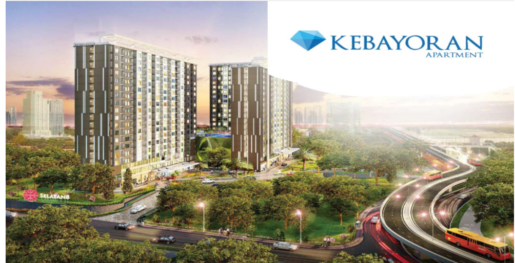
Location Kebayoran, South Jakarta 20 stories + 1 Basement Apartment