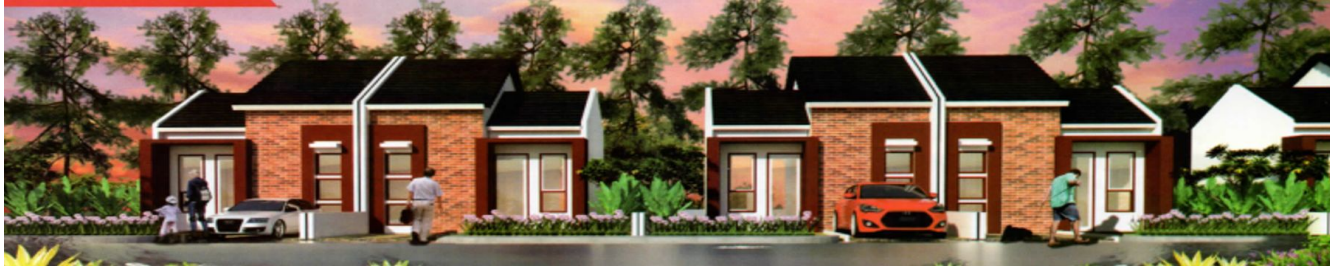
Location Citayam, Bogor Housing Estate