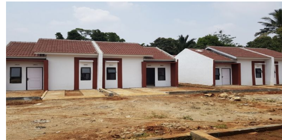
Location Nanggerang, Bogor Housing Estate