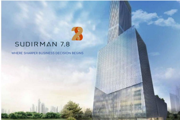
Location CBD, Central Jakarta 44 stories + 5 Basements Officetel