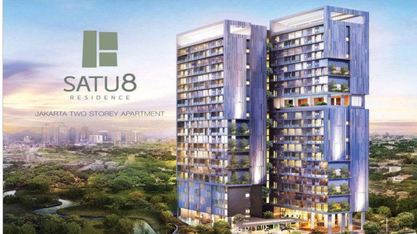
Location Puri Kembangan, West Jakarta 24 stories + 3 Basements Apartment