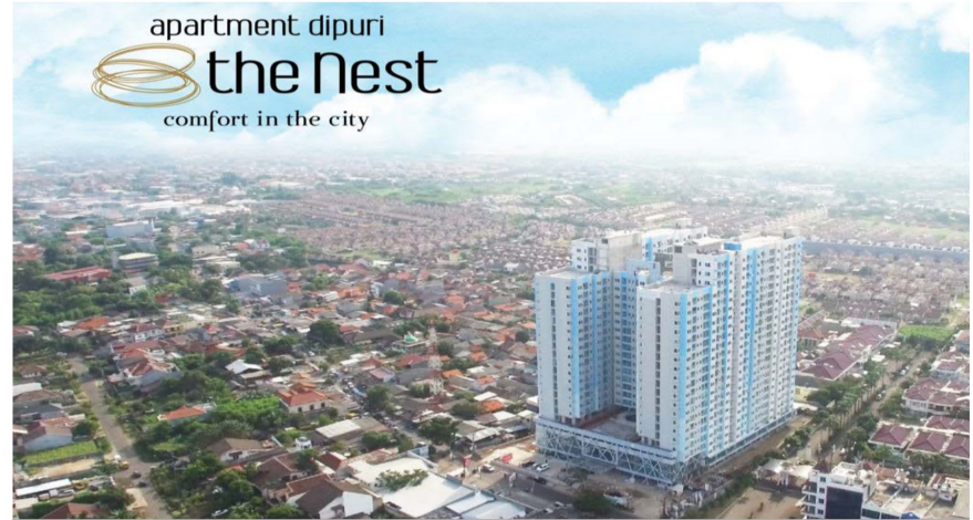
Location Puri, West Jakarta 24 stories + 2 Basements Apartment