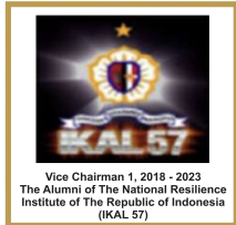
Vice Chairman 1, 2018 - 2023 The Alumni of The National Resilience Institute of The Republic of Indonesia (IKAL 57)