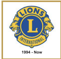
1994 - Now