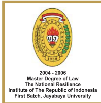
2004 - 2006 Master Degree of Law The National Resilience Institute of The Republic of Indonesia First Batch, Jayabaya University