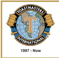
1997 - Now