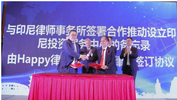
MoU between TOPWE Law Firm, Happy SP Sihombing Law Firm and Mega Global Investment