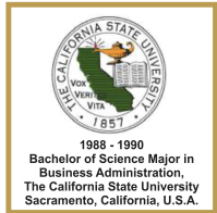
1988 - 1990 Bachelor of Science Major in Business Administration, The California State University Sacramento, California, U.S.A.